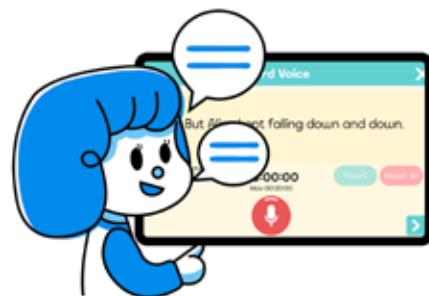
② Press the subtitle.